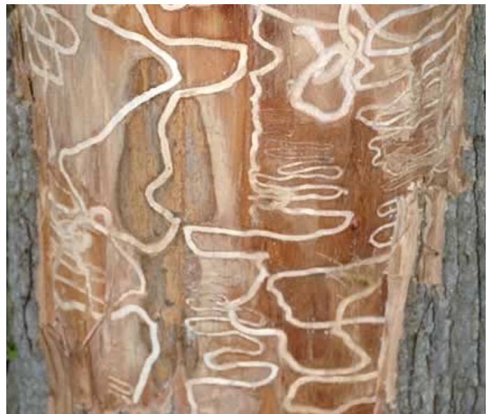
Tracks made by EAB.

Emerald ash borers attack ash trees only, one of North America's most abundant woodland trees. Depending on how warm the weather is, adult EAB will appear in mid-to-late-May due to infestations the previous year, when the females laid their eggs. The larvae tunnel into the ash tree and feed under the bark, leaving visible tracks underneath. Larvae feeding stops the tree from properly transporting water and nutrients, so the tree suffers from dieback and split bark.